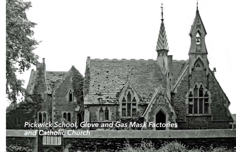
Pickwick School, Glove and Gas Mask Factories and Catholic Church

▶ Turn left at A4 to Pickwick; take care crossing A4, and retrace walk back to Springfield Campus.