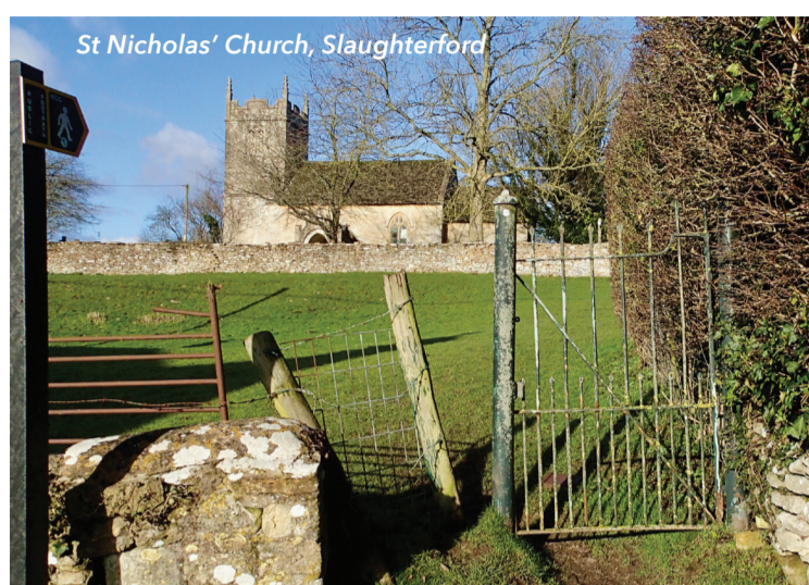
St Nicholas' Church, Slaughterford

▶ Retrace your steps back to Brookside Cottage and take the footpath on your right for 150m to view the Rag Mill and a little further on to the By Brook.