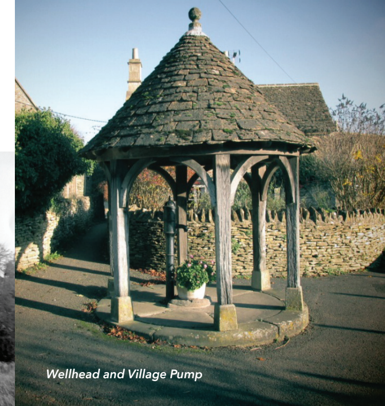
Wellhead and Village Pump