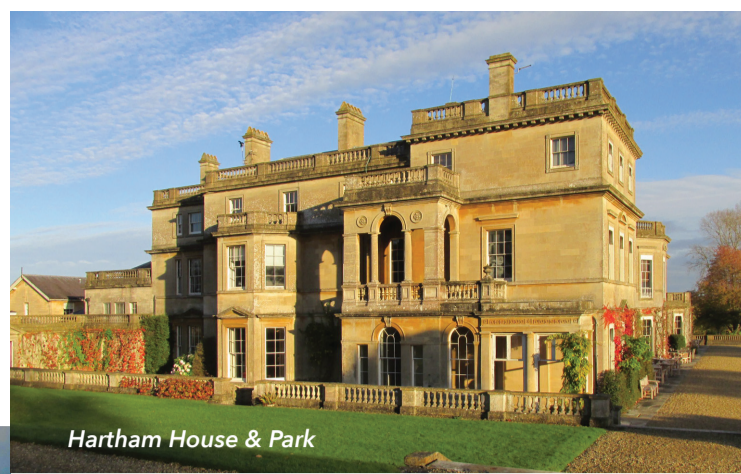
Hartham House & Park