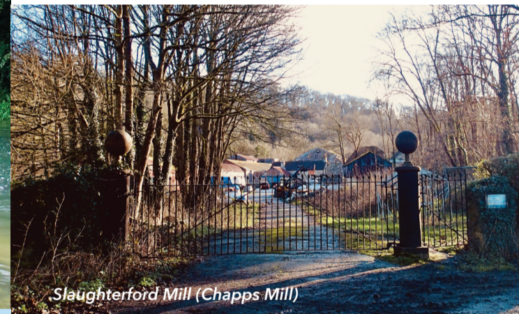
Slaughterford Mill (Chapps Mill)

▶ Retrace your steps back onto Slaughterford Lane and walk ahead to cross over the bridge over the By Brook past the entrance to Slaughterford Mill. Take the lane on your left and follow the By Way on your left to pass through the mill site.