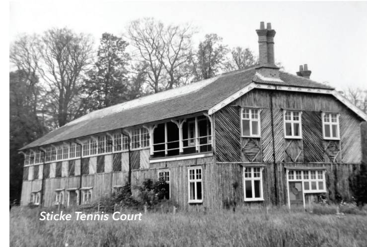
Sticke Tennis Court

The 1870s stone-tiled wellhead and cast-iron pump is an example of the wealthy local owner of Hartham Park, Thomas Henry Allen Poynder Esq's. social improvement to Biddestone. Mains water reached the village in 1955. The pump was capped after local teenagers flooded the street during their many assignations around the wellhead!