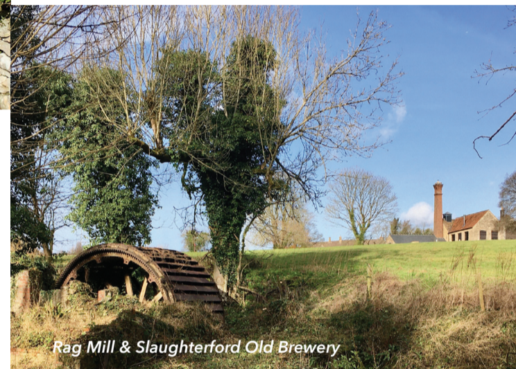
Rag Mill & Slaughterford Old Brewery

In 2018, the Cotswold Voluntary Wardens helped clear the Rag Mill site of dead or invasive trees and overgrowth to preserve the site. A plaque to mark this work, as part of the 50th anniversary of the Voluntary Warden Service, was placed on the Rag Mill gate.