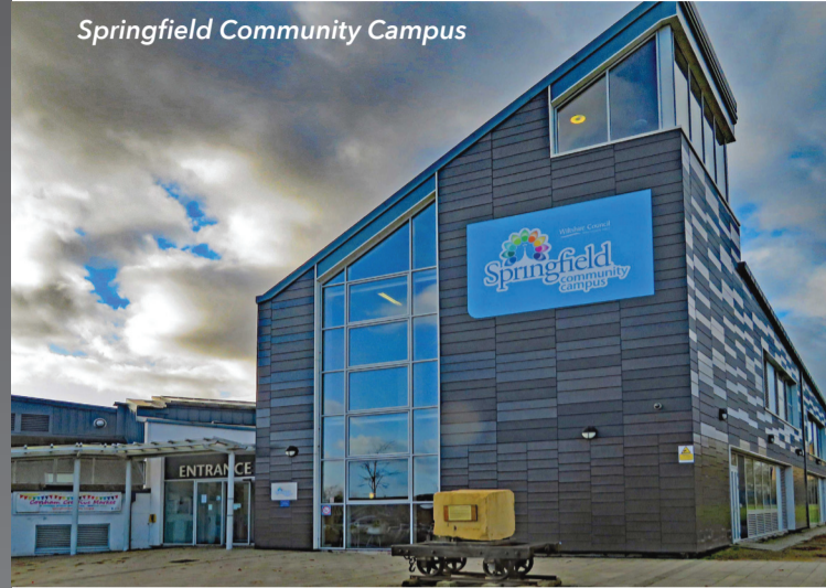
Springfield Community Campus

▶ Turn left and follow Beechfield Road to Valley Road and turn right towards Pickwick Road and left to reach the Hare and Hounds.