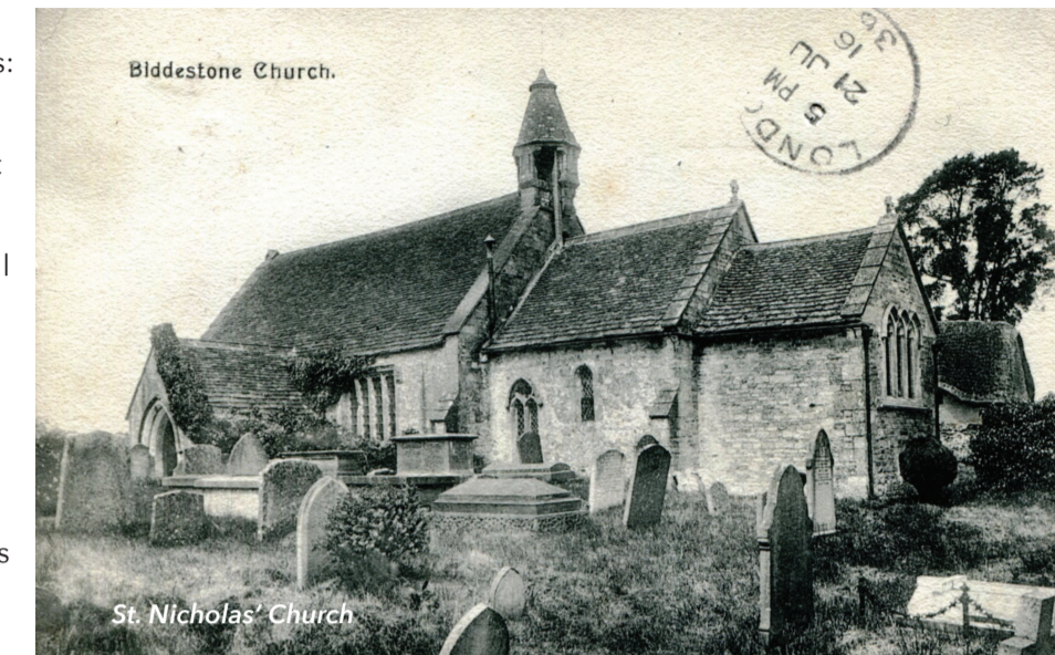
St. Nicholas' Church

▶ Continue past St. Nicholas' Church and pass the Wellhead and Village Pump to reach Turnpike Cottage. Carefully cross Church Road to the White Hart and duck pond.